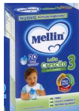
MELLIN LATTE CRESCITA 3 e 4 700 gr