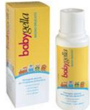
BABYGELLA BAGNO DELICATO 500 ml