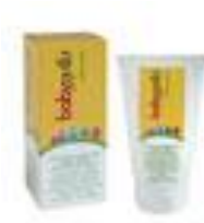
BABYGELLA CREMA CORPO 100 ml