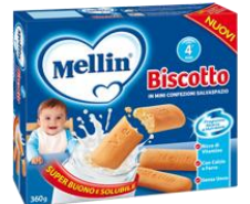
MELLIN BISCOTTI 360 gr