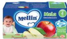
MELLIN OMOG. FRUTTA 6X100 gr frutta mista, mela, pera, mela e banana, prugna