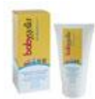
BABYGELLA DETERGENTE 2 IN 1 300 ml