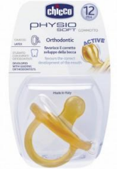
CHICCO GOMMOTTO CAUCCIÙ 1 PZ 0M\12M