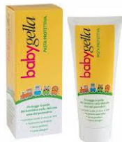
BABYGELLA PASTA TUBO 100 ml