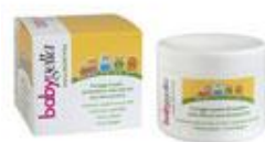
BABYGELLA PASTA PROTETTIVA 150 ml