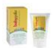
BABYGELLA CREMA IDRATANTE 50 ml