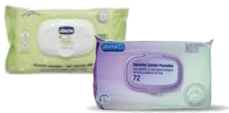
SALVIETTE CAMBIO PANNOLINO