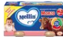
MELLIN OMOG. CARNE 4X80 gr coniglio, pollo, manzo, vitello