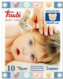
PANNOLINI TRUDY BABY CARE