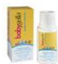
BABYGELLA BAGNO PRIMI MESI 200 ml