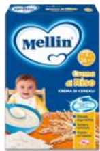
MELLIN CREMA 250 gr riso, mais tapioca, multicereali, semolino