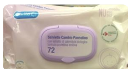
SALVIETTE CAMBIO PANNOLINO ALVITA