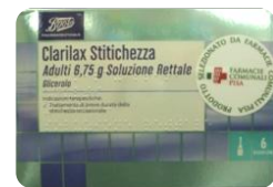
CLARILAX STITICHEZZA ADULTI 6 MICROCLISMI BOOTS PHARMA