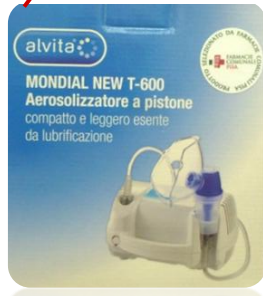
APPARECCHIO AEROSOL ALVITA