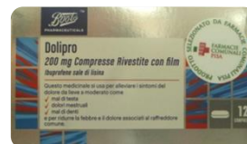
DOLIBRO 200MG 12 CPR BOOTS PHARMA