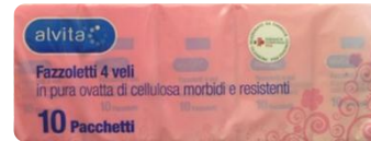
FAZZOLETTI DI CARTA 4 VELI ALVITA