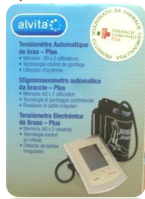
MISURATORE DI PRESSIONE DA BRACCIO ALVITA