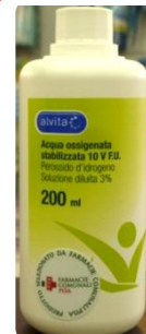
ACQUA OSSIGENATA 200ML ALVITA