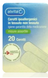
CEROTTI MISURE ASSORTITE 20 PEZZI ALVITA