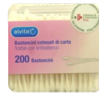
BASTONCINI COTONATI 200 PEZZI ALVITA