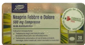
NEAPRIN FEBBRE E DOLORE 500MG 20 CPR BOOTS PHARMA