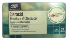
CLARACID BRUCIORE DI STOMACO 500MG 24 CPR BOOTS PHARMA