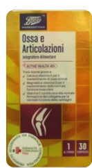
BOOTS PHARMA OSSA E ARTICOLAZIONI CALCIO + MAGNESIO