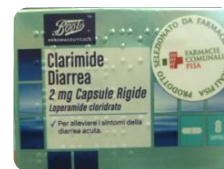
CLARAMIDE DIARREA 2MG 8 CPS BOOTS PHARMA