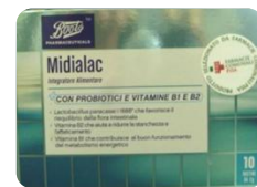
MIDIALAC 10 BUSTE 2G BOOTS PHARMA