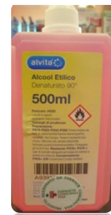
ALCOOL ETILICO DENATURATO 500ML ALVITA